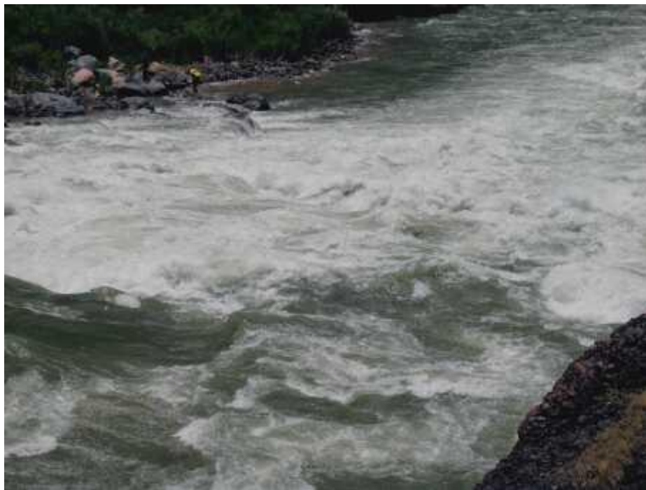
Figure 1: Colorado River Rapids

In 2006, the United States Geological Survey sent a team to the Colorado River in Utah to measure river flow speeds in the Cataract Canyon rapids (Magirl et al., 2009). The river rapids at this location are well known for their fast and violent flows through the canyon. A picture showing Colorado River rapids is provided to illustrate this type of flow conditions in Plate 1 below. The peak flow speed measured in the river rapids was reported as 6 metres per second (m/s) which equates to approximately 22 kilometres per hour (km/h). Other estimates of flow speeds in the Colorado River rapids by experienced white water rafters put the flows at 25 to 35 miles per hour ( http://www.teamsantafe.org/05newsletters/newsletter_2005_07.shtml , sourced 28 July 2015) which is approximately 40 to 55 km/h (11 to 15 m/s).