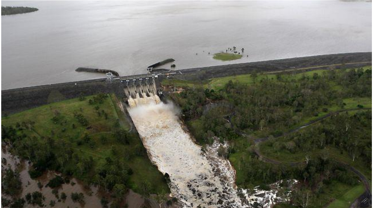
Figure 2: Wivenhoe Dam Spillway

21 m/s or 75 km/h. Large flip bucket spillways on major dams are typically designed for flow speeds in the order of 15 to 20 m/s (55 to 70 km/h).